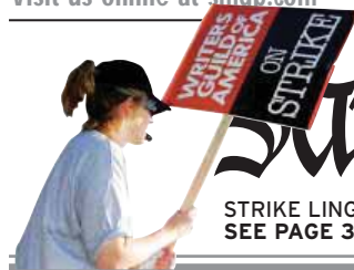
STRIKE LINGERS SEE PAGE 3