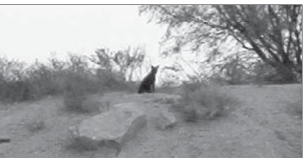
CALL OF THE WILD: A black panther keeps careful watch of the Oplin, Texas, ranch where a Santa Monica production team hopes to film an independent movie.